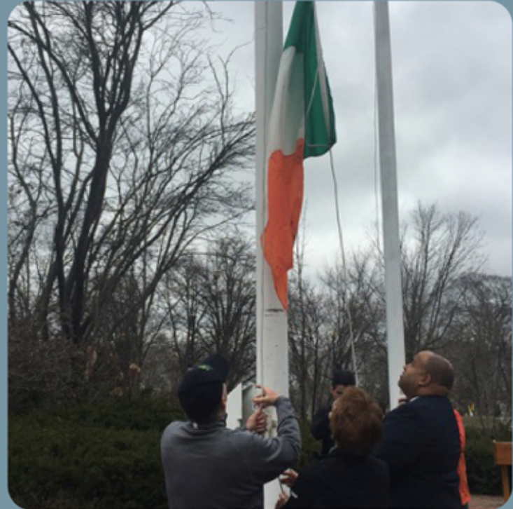
The Irish Flag Raising took place on March 1 to kick off Irish Heritage month.